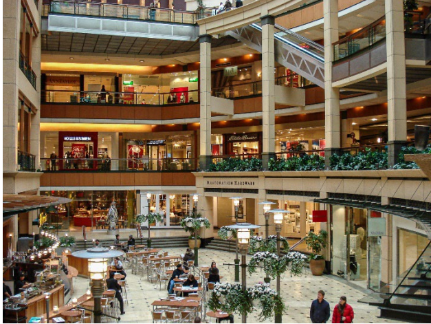
Pacific Center Mall – Seattle