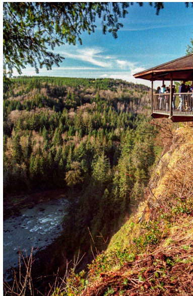
Overlook – Snoqualmie Falls