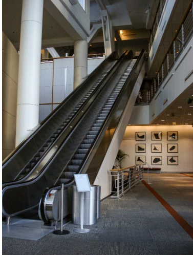
Bellevue Convention Center