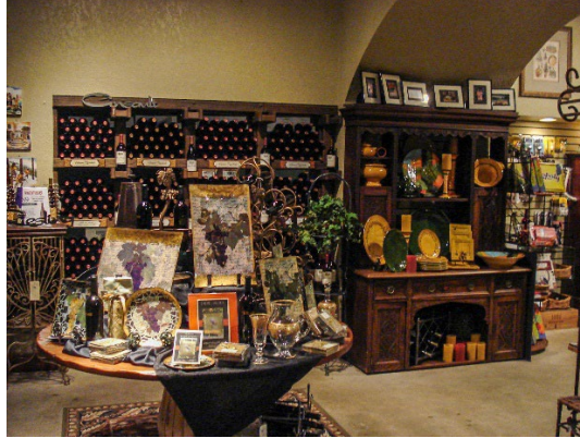
Chateau St Michelle Gift Shop