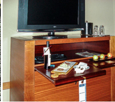
Amenities in my room