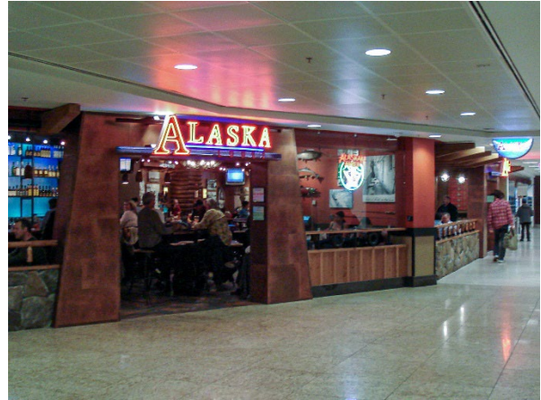
"Alaska Lodge Bar" – SeaTac Airport

Not long after, boarding was announced for the flight to Ontario, and I settled into a comfortable first-class seat. After takeoff, a very tasty dinner of grilled chicken and marinara pasta was served, along with a glass of Chateau St Michelle Cabernet Sauvignon wine. While I enjoyed the delicious dinner, we flew over the snow-covered Oregon Cascade Mountains, and I had to conclude that this PCMA conference was one of the very best – thank you Seattle! (next year the conference will be held in New Orleans, also in January – stay tuned!)