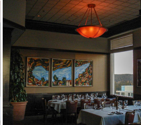
Daniel's Bar & Grill – Bellevue Hyatt Hotel