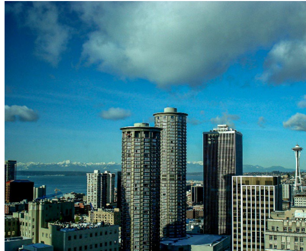
View from my hotel room

In addition, to the spectacular view, the room had a huge bathroom tiled with Italian white marble, a Jacuzzi bathtub, and a large walk-in shower! (thanks Ed) After unpacking my bags and settling in, I went down to the lobby bar for a beer and to join everyone watching the NFL playoff game between Green Bay and Seattle, being played in Green Bay. The game was plagued by heavy snow, not “unexpected” in Green Bay during the winter. Unfortunately, Seattle lost the game in the final minutes and its chance to compete in the Super Bowl – much to the dismay of the locals in the bar!