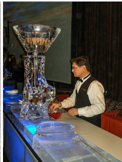
Iced Mojitos – Closing Reception