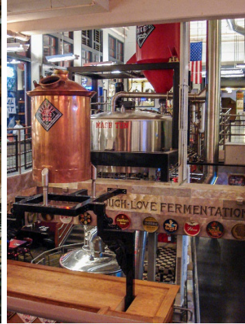
Pike Place Brewery