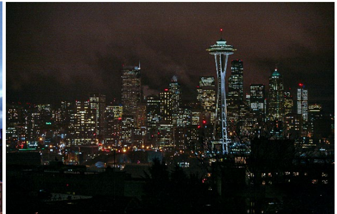
Seattle at night