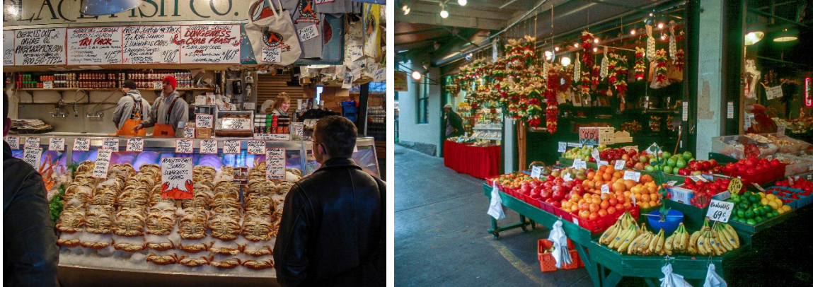
Pike Place Farmers Market

whole fish to each other as customers pointed out the fish they wanted to buy. It always draws a big crowd to watch, and once in a while, they will throw a fake rubber fish into the crowd, just to scare them!