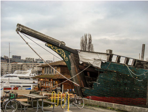
Historic old Clipper Ship being restored

Some really fascinating maritime history of Seattle. Nearby was the “Wooden Ship Building Society” that was restoring an old wooden clipper ship that once transported huge logs from the forests of the Pacific Northwest to Asia. Today, logs are still shipped from Seattle to Asia aboard huge cargo freighters powered by enormous diesel engines.