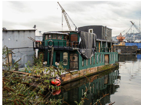
“Houseboat” on Lake Union

As I walked along the shore of Lake Union toward Eastlake, I came upon some new shops and restaurants overlooking the lake. “Dukes Chowder House” looked particularly inviting, especially in the chilly wind off the lake, so I stopped in for lunch at the bar where I had a fabulous “Bleu Cheese crusted Halibut filet, together with chips and hot sourdough bread, along with a chilled glass of IPA from the local Fremont Brewery. After lunch, I visited the small, but very interesting “Puget Sound Maritime Museum” which had several beautiful scale models of old sailing ships, as well as many old historical photographs of Seattle’s shipping industry. By the time I reached Eastlake, it was time to head back to the hotel, pick up my