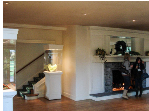
Chateau St Michelle Winery