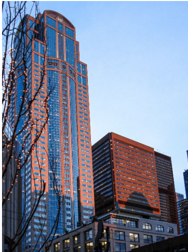
Grand Hyatt Hotel