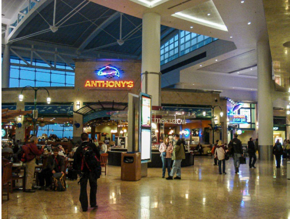
"Pacific Market Place" – SeaTac Airport

It was a quick trip with the hotel shuttle to SeaTac Airport, but once I arrived, I found it to be very busy, with long lines going through the security checkpoint. Finally, having passed through security, I went straight to the Alaska Airlines Board Room lounge, which was also a bit crowded, but I was able to find a seat at the bar and a cold glass of Alaskan Amber beer – very relaxing!