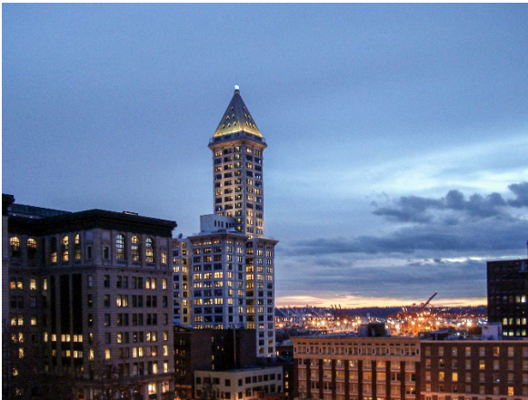
Smith Tower – oldest high rise building in Seattle