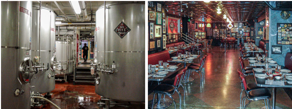
Pike Place Brewery tour

After the luncheon, I joined a small group for a tour of the Pike Place Brewery for an event called “pairing of beer with food”. The owner of the brewery took us on a short walk through the facility and gave us a detailed explanation of the brewing process. The Pike Place Brewery used the “bottom fermentation” process to produce its traditional style ales and stouts, as opposed to “top fermentation” which is used for lagers and pilsners.