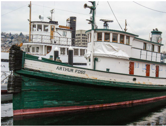
“Arthur Foss” tugboat

The next morning, after completing my office email correspondence, I packed my bags, checked out of my hotel room, and stored my bags with the bell desk. (I had quite a hard time trying to pack all the gifts I had received during the conference, however, I finally managed to do so without leaving any gifts behind) Then I picked up a Starbucks coffee, and with my camera in hand, I walked down to the new South Lake Union Park, part of a very large, ambitious redevelopment project financed by Paul Allen and designed to transform the area from downtown Seattle all the way to Lake Union with many new shops, restaurants, bars, and condos – like an “urban oasis”. Included in the project was a new streetcar line connecting the Eastlake neighborhood with downtown. As I explored the area, I discovered the “Historic Ships Wharf” that was once the US Naval Reserve Base on the shore of Lake Union. Among the old ships docked at the wharf were some famous ocean-going tugboats, including the “Arthur Foss”, as well as the last remaining “lightship” in service that is still steam powered!