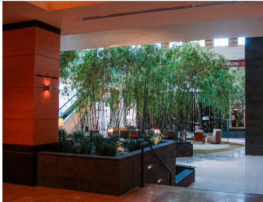
Bellevue Hyatt Hotel lobby