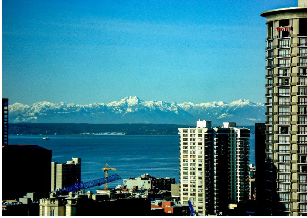
View of the Olympic Mountains from my hotel room